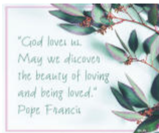
BAPTISM OF THE LORD

Blessings to all of you. Thanks to your generosity we have achieved our 2020 goal! As of December 30, the Appeal raised $1,347,348 in gifts and pledges toward the goal of $1,300,000. Every dollar raised goes directly to ministries that support our Catholic faith and is not used for any other purpose.